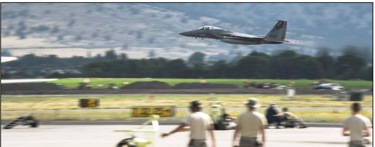
A U.S. Air Force F-15C Eagle takes off using the afterburner during Sentry Eagle 2017 from Kingsley Field, Klamath Falls, Ore. July 23, 2017. Sentry Eagle is a large scale air-to-air combat exercise hosted by the Oregon Air National Guard every other year.