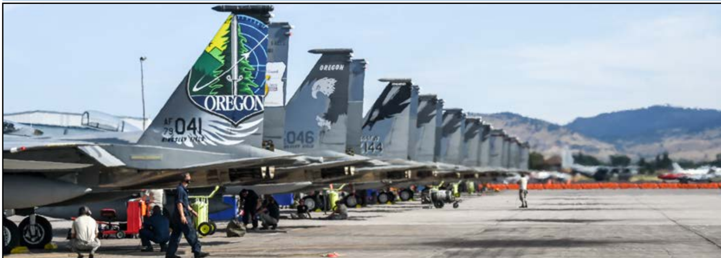
U.S. Air Force F-15C Eagle fighter jets are parked on the flight line before flying in the final day of Sentry Eagle 2017 at Kingsley Field, Klamath Falls, Ore. July 23, 2017. Sentry Eagle is the largest Air National Guard hosted exercise of its kind. It prepares the units participating to work with each other if a real world need occurs.