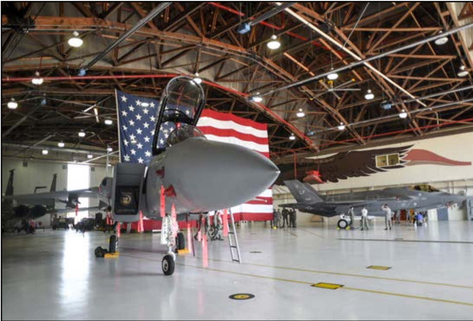
A U.S. Air Force F-15C Eagle fighter jet and F-35A Lightning joint strike fighter are set up in preparation for the open house portion of Sentry Eagle 2017 at Kingsley Field, Ore. July 21 2017. The 173rd Fighter Wing hosts Sentry Eagle every other year, and open its doors to the public.

Sentry Eagle is the largest Air National Guard hosted exercise of its kind. It prepares the units participating to work with each other if a real world need occurs.